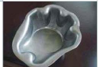
Sheet Metal Part