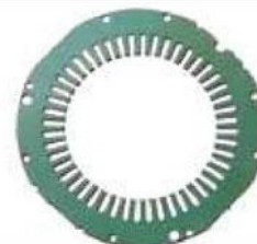
Sheet Metal Part